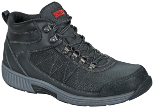
488 Hunter Blk