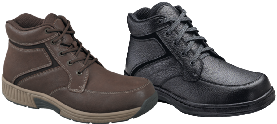
484 Highline Dk Brn