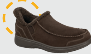
Men's Vito, page 25

WOMEN'S SIZES: 5, 5.5 – 12, WIDTHS: Medium (B), Wide (D), X-Wide (2E), XX-Wide (4E)