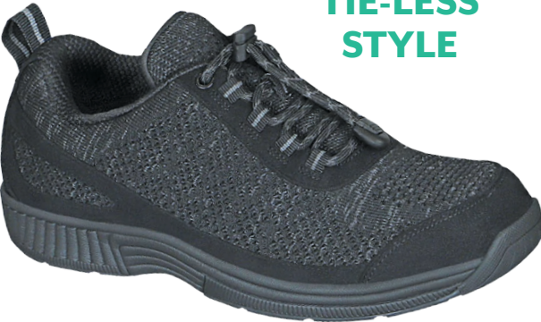
633 Lava No Tie Blk