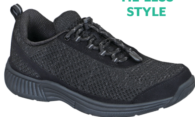
977 Coral No Tie Blk