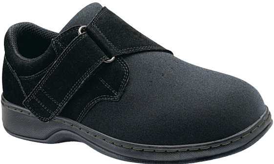
525 Bismark Blk