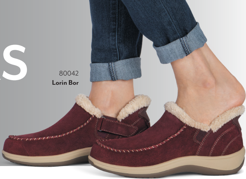
80042 Lorin Bor