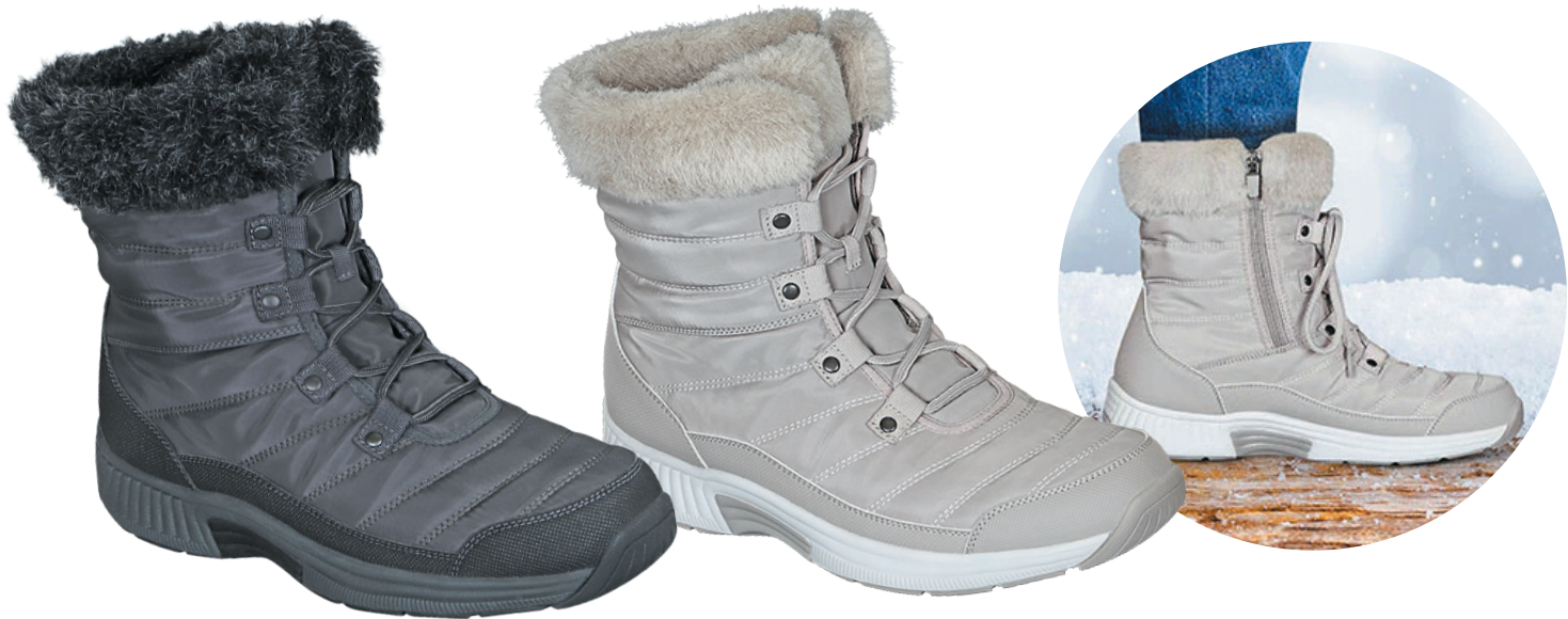
897 Alps Blk , 899 Alps Beg