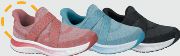
Women's Naya, page 7