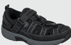
Men's Clearwater, page 24