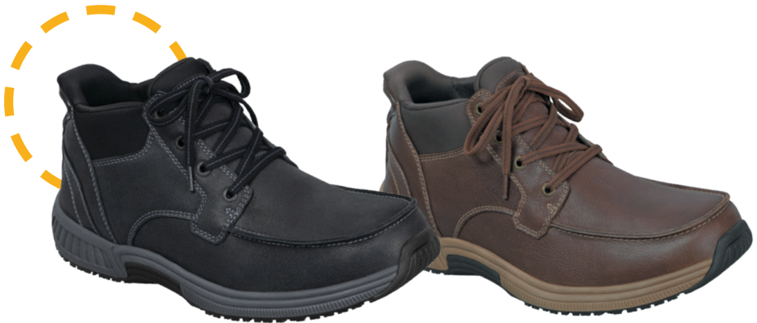
40011 Verno Blk , 40012 Verno Brn