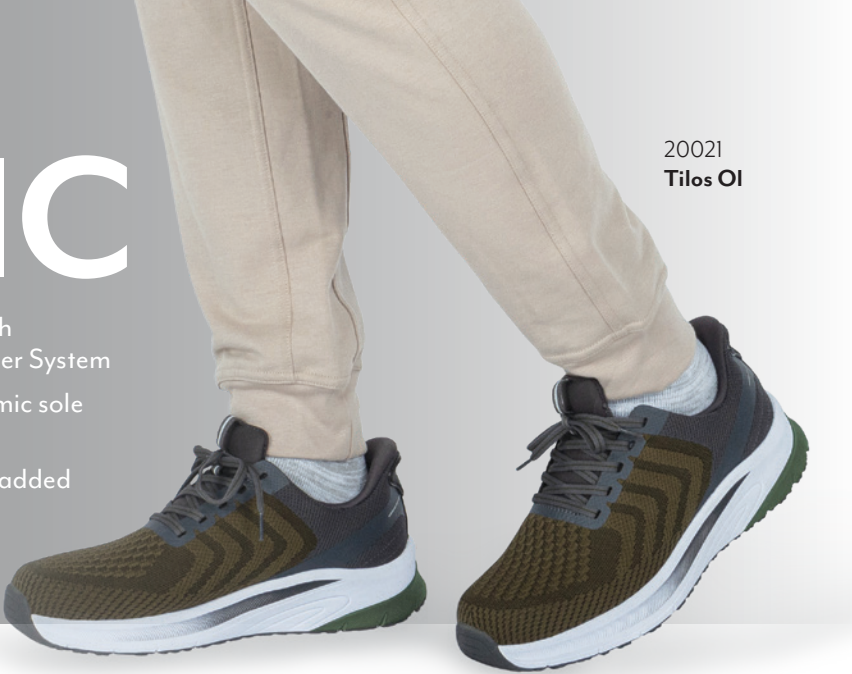
20021 Tilos Ol