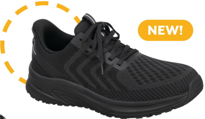
20018 Tilos Blk/Blk