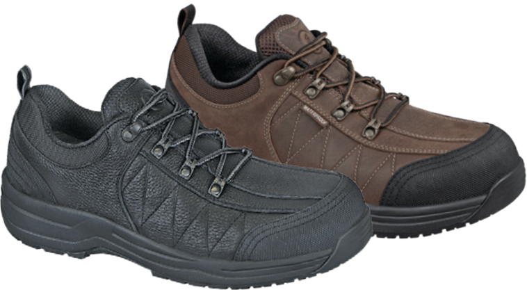
691 Dolomite Blk, 692 Dolomite Brn