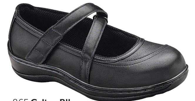
865 Celina Blk