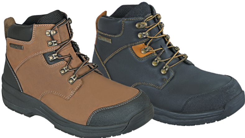
682 Granite Cam