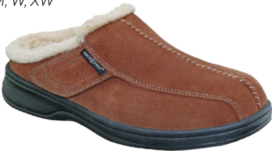
S331 Asheville Brn (Not Covered by Medicare) Widths: M, W