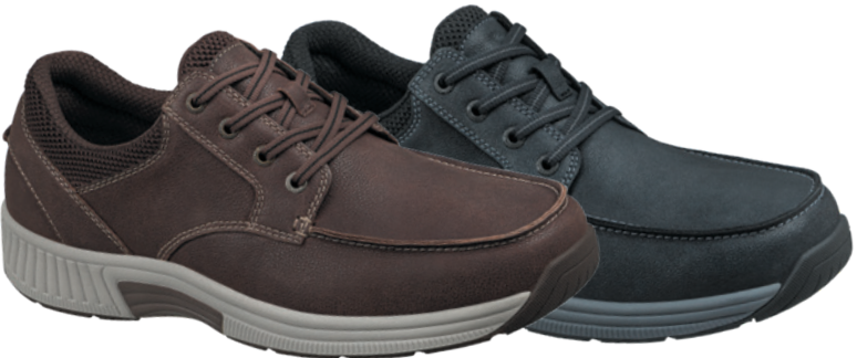
428 Leo Brn, 429 Leo Blk