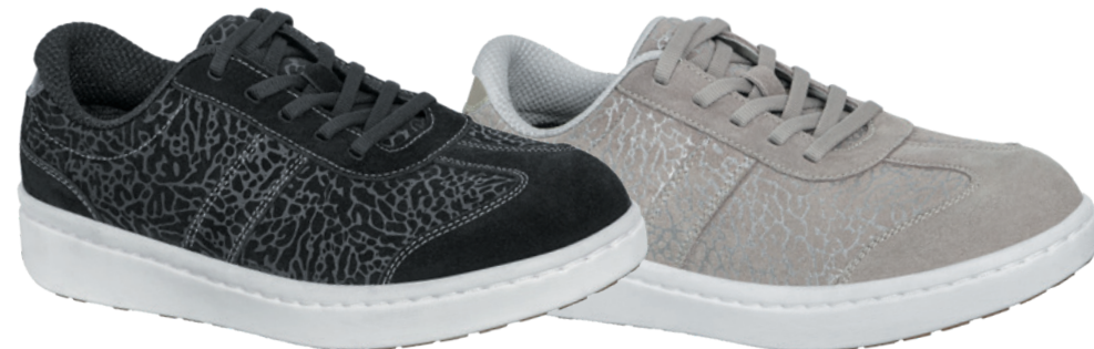
71101 Stroll Blk, 71103 Stroll Tau