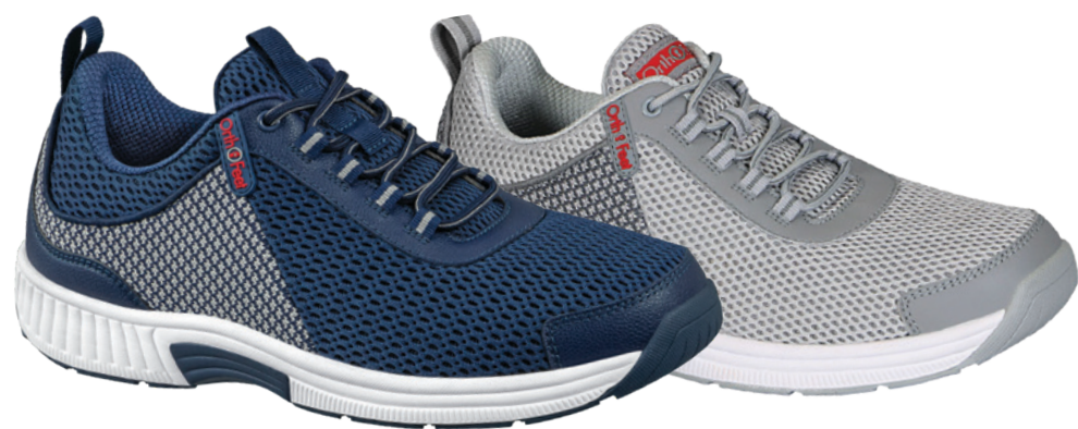
616 Edgewater Blu , 618 Edgewater Gr