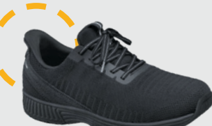
Men's Yari, page 15