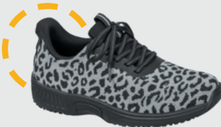
Women's Kita, page 3