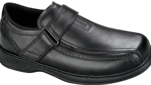
585 Lincoln Center Blk