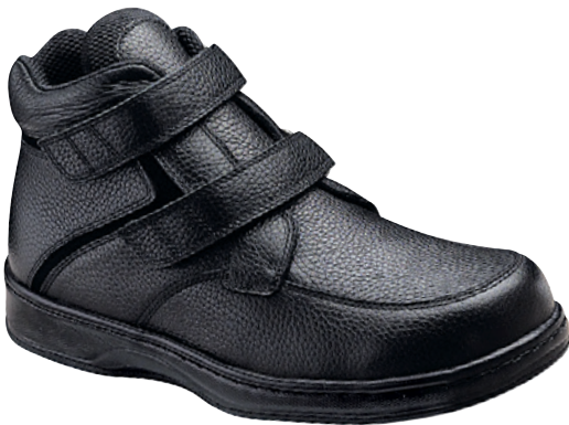
581 Glacier Gorge Blk