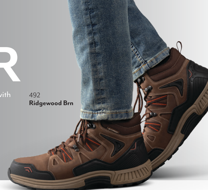
492 Ridgewood Brn