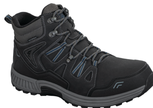
491 Ridgewood Blk