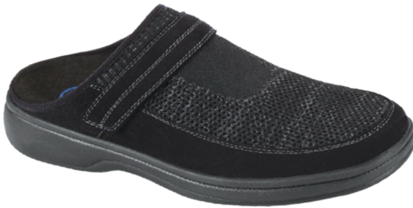
334 Hudson Blk (Not Covered by Medicare) Widths: M, W