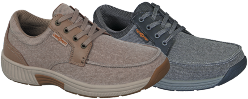
426 Porto Beg, 425 Porto Gr