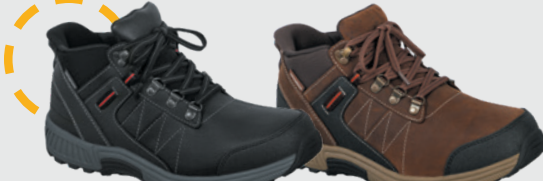
Men's Dalton, page 21