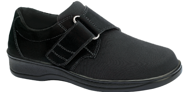
825 Wichita Blk