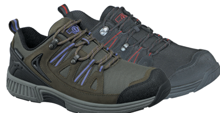
947 Moravia Kh, 946 Moravia Blk