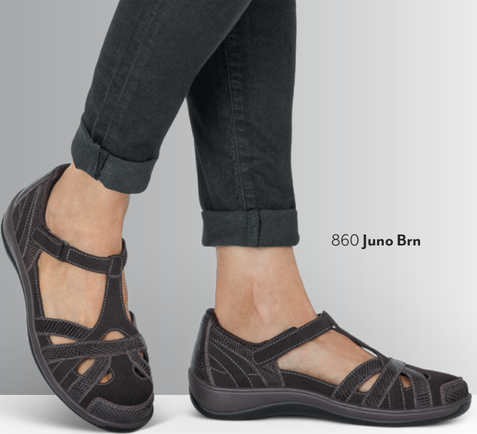
860 Juno Brn