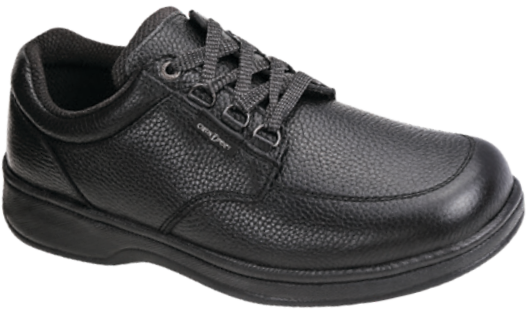
410 Avery Island Blk