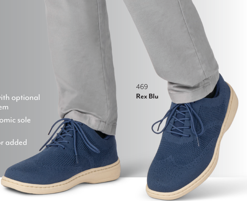
469 Rex Blu