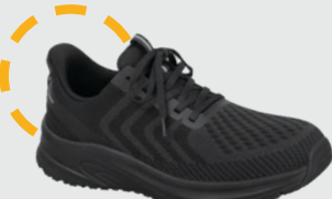
Men's Tilos, page 16