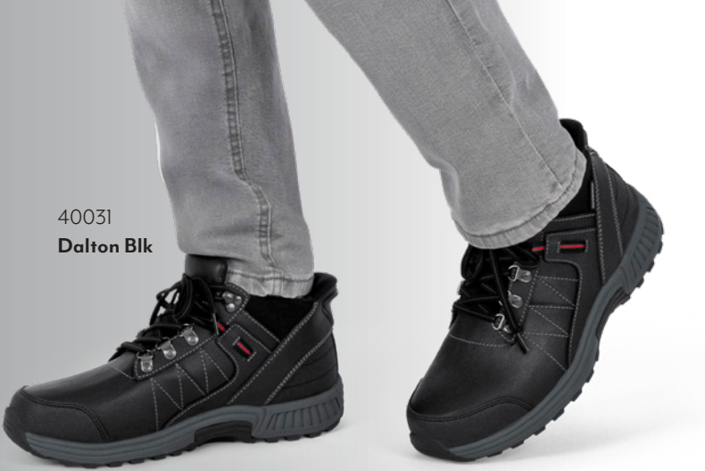
40031 Dalton Blk