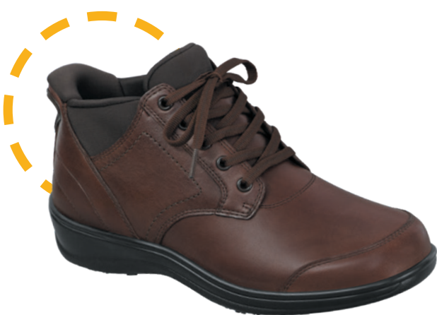
90014 Rosel Brn