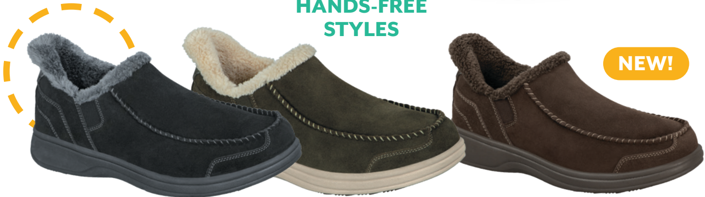
20101 Vito Blk , 20102 Vito Dk Ol , 20103 Vito Brn Widths: M, W, XW