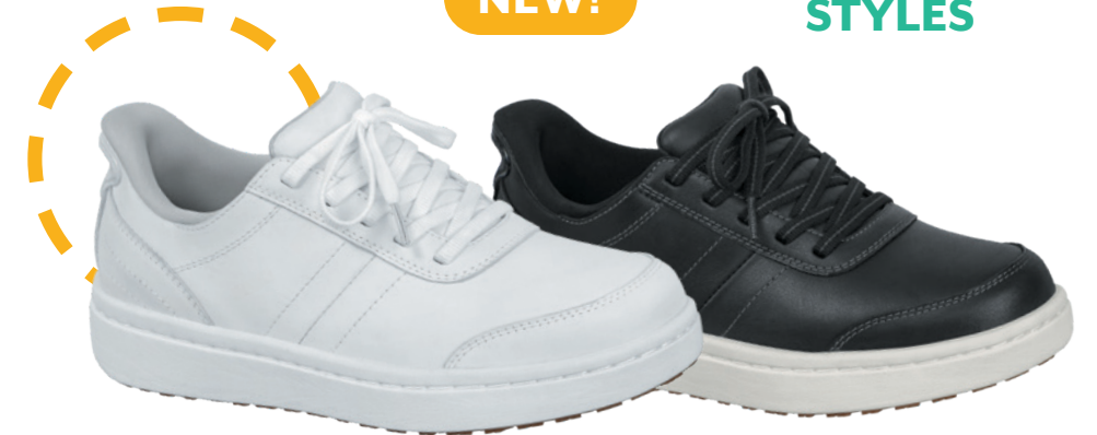
81104 Wander Wht, 81105 Wander Blk