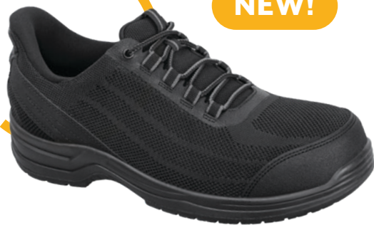
40821 Onyx Blk