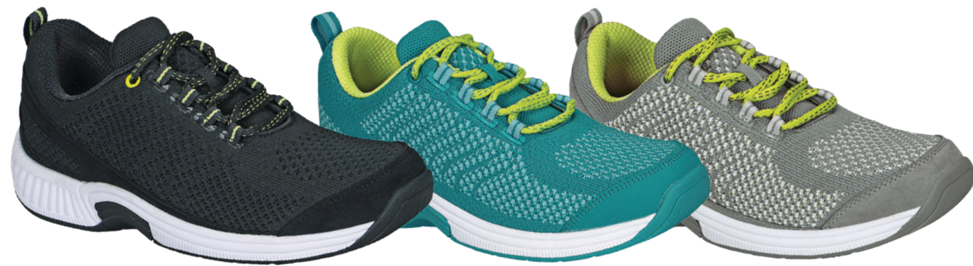
981 Coral Blk