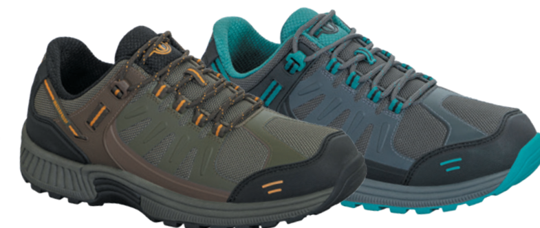
848 Alma Ol, 847 Alma Gr