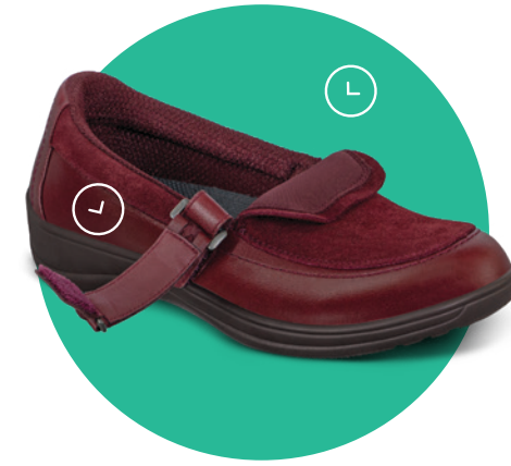
819 Chelsea Dk Ch Two-Way Strap System