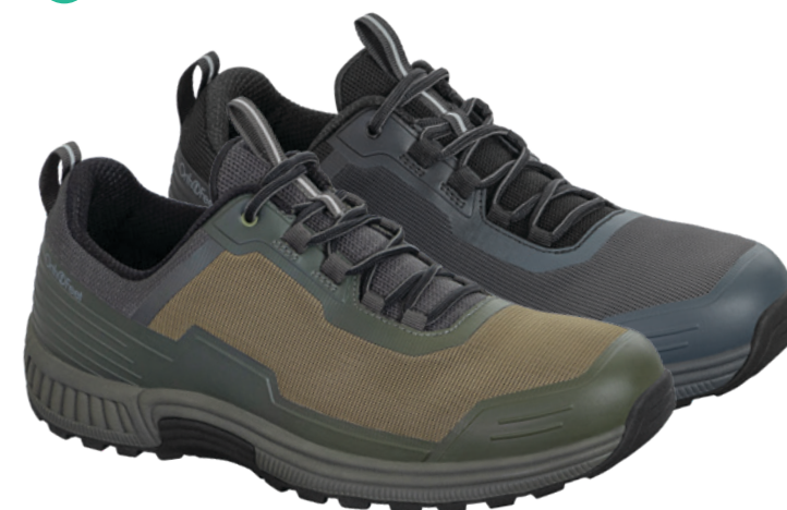
648 Cascade Ol , 649 Cascade Blk