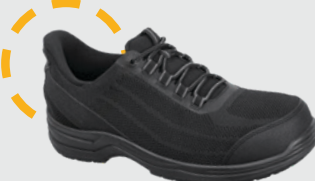
Men's Onyx, page 23