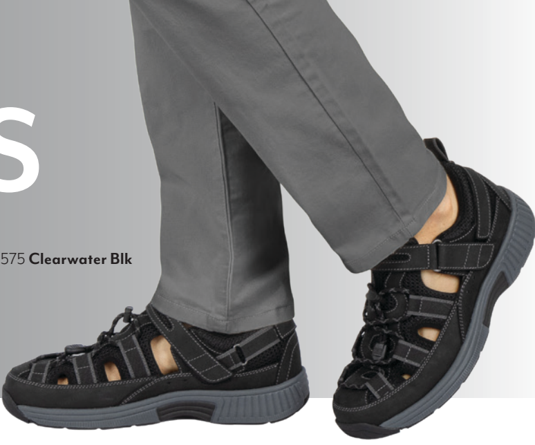
575 Clearwater Blk