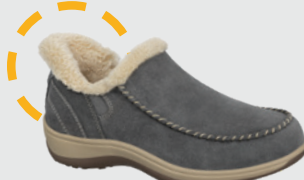
Women's Lorin, page 13