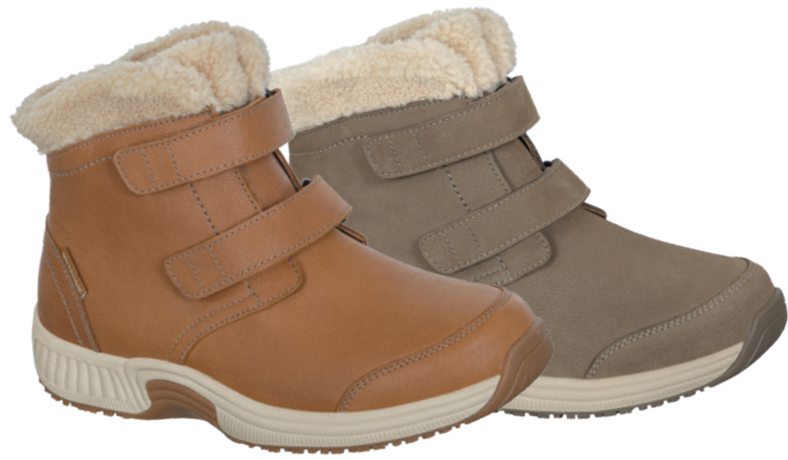
91011 Florence Cam , 91012 Florence Tau