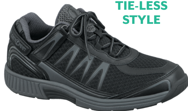
675 Sprint Blk