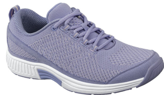
983 Coral Lav