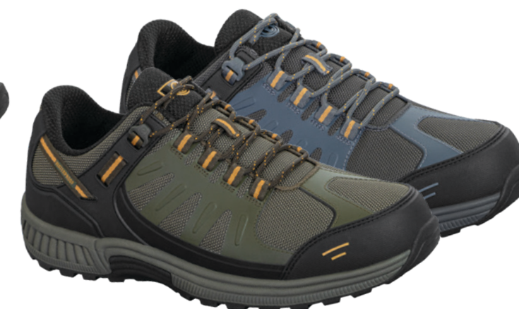
646 Avalon Ol , 647 Avalon Gr