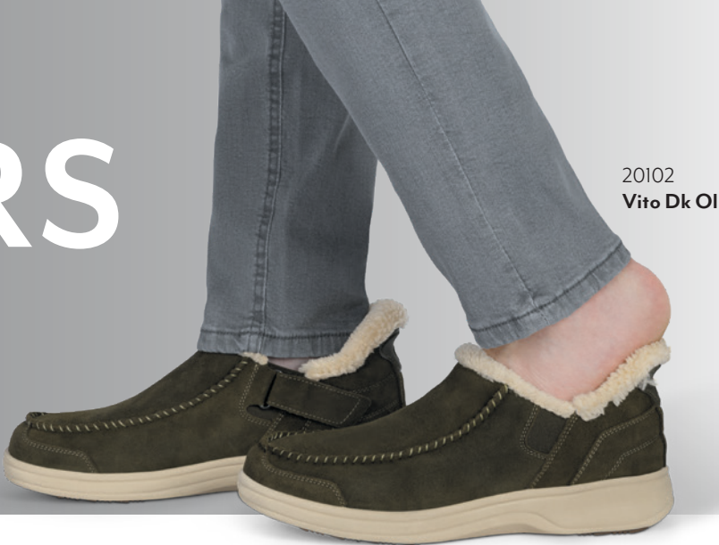
20102 Vito Dk Ol