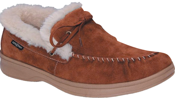
337 Tuscany Brn (Not Covered by Medicare) Widths: M, W