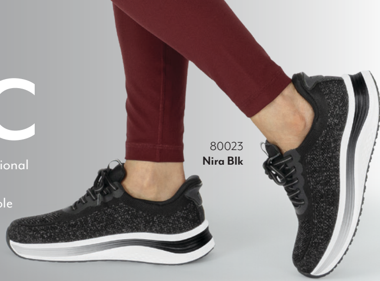
80023 Nira Blk