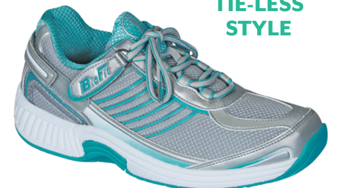
975 Verve Tur