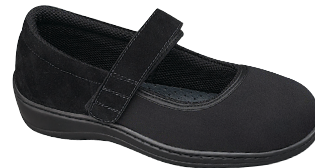
827 Springfield Blk