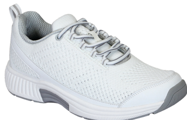
988 Coral Wht