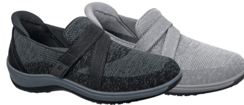
80061 Amalya Blk, 80062 Amalya Gr