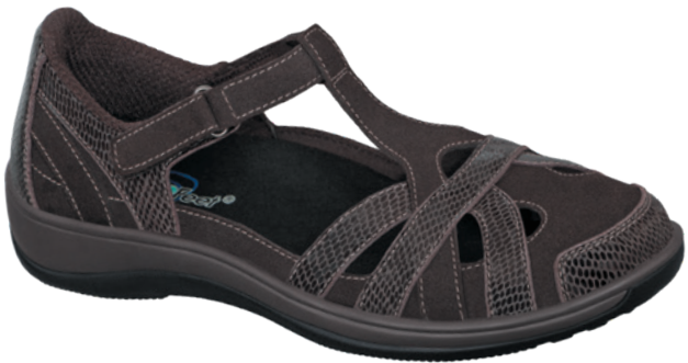
860 Juno Brn (Not Covered by Medicare) Two-Way Strap System