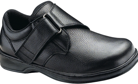
510 Broadway Blk