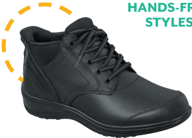
90013 Rosel Blk