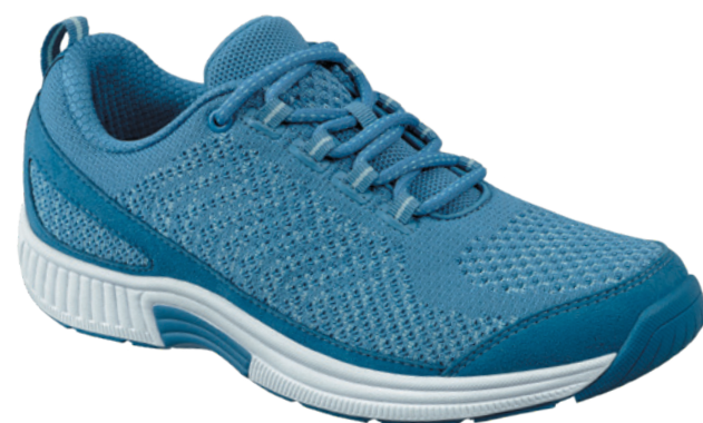
984 Coral Blu