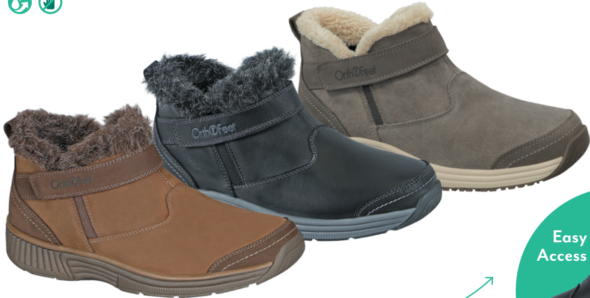
792 Siena Brn, 793 Siena Blk, 794 Siena Tau