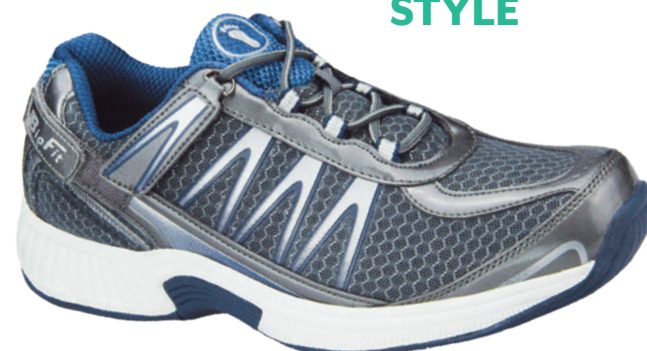
672 Sprint Gr