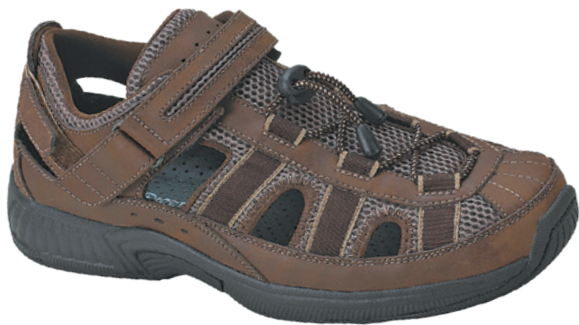
573 Clearwater Brn