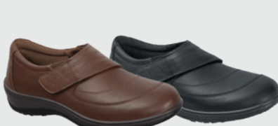
Women's Emily, page 7