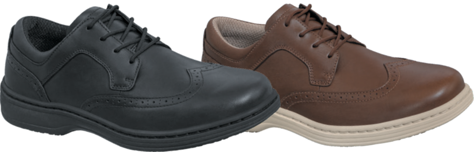
22002 Moreno Blk, 22003 Moreno Brn