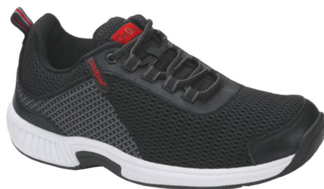
617 Edgewater Blk