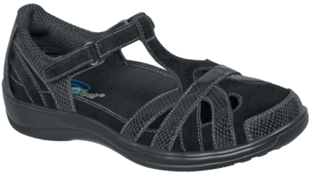
862 Juno Blk (Not Covered by Medicare) Two-Way Strap System