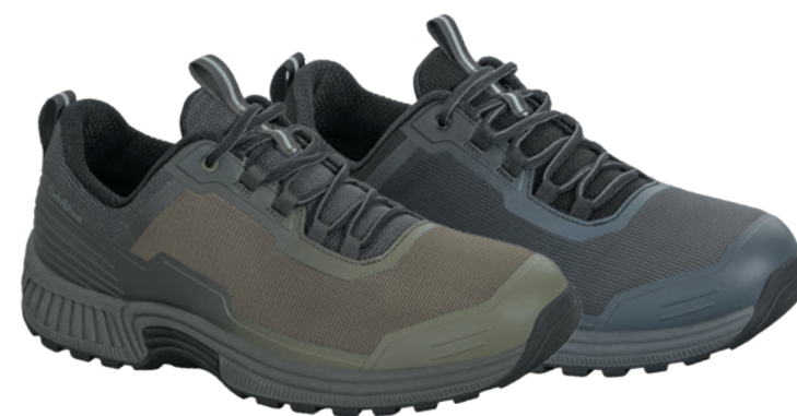
840 Bristol Ol, 842 Bristol Blk