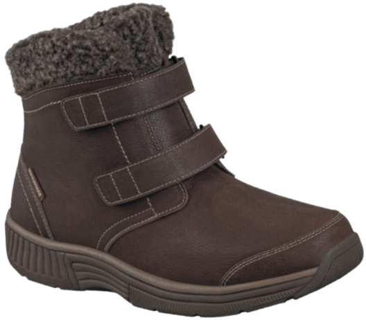
867 Florence Brn