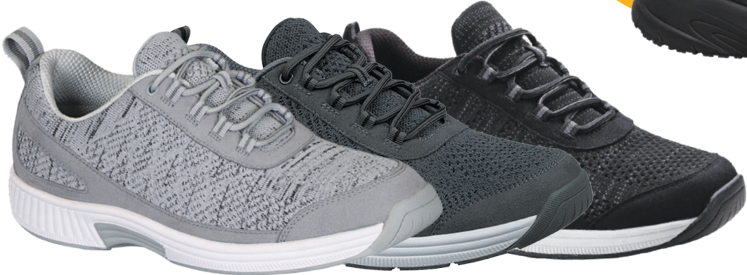
613 Lava Gr, 614 Lava Dk Gr, 619 Lava Blk