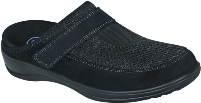
732 Louise Beg (Not Covered by Medicare) N Widths: N, M, W, XW