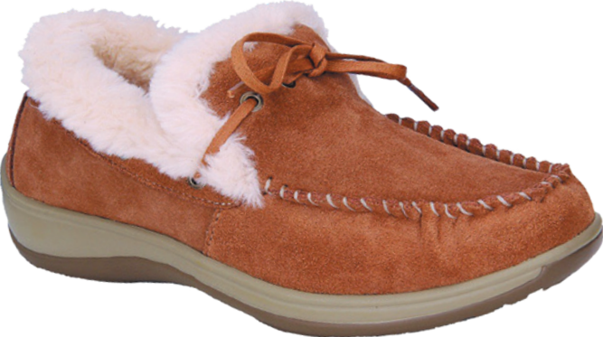
737 Capri Cam (Not Covered by Medicare) Widths: M, W