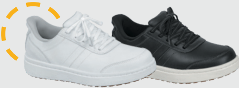
Women's Wander, page 4