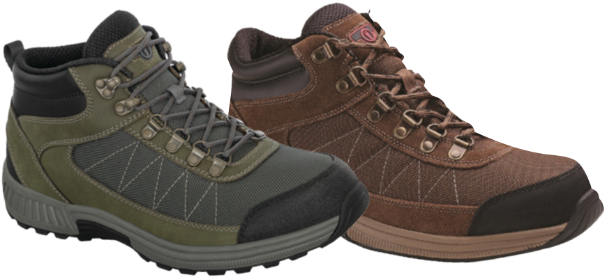
490 Hunter Ol , 489 Hunter Brn