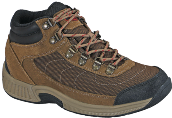
882 Delta Brn