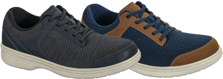
2021 Tabor Ch, 2015 Tabor Blu