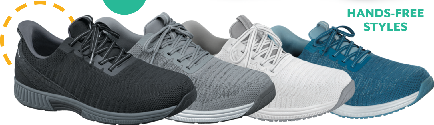
20011 Yari Blk, 20013 Yari Gr, 20015 Yari Wht, 20014 Yari Blu