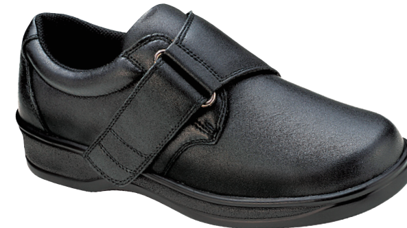
810 Arcadia Blk