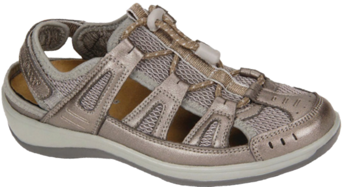
997 Verona Pew