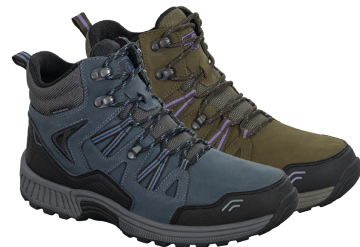
892 Dakota Blu, 894 Dakota Ol