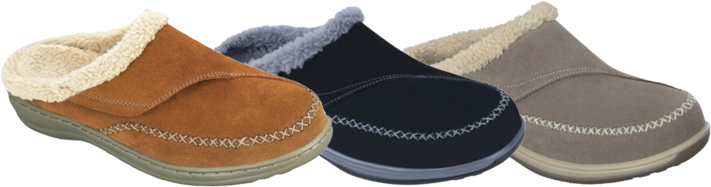
S731 Charlotte Brn, S733 Charlotte Blk, S735 Charlotte Tau (Not Covered by Medicare) Widths: M, W, XW