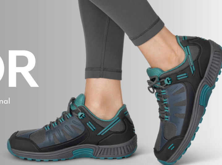
847 Alma Gr