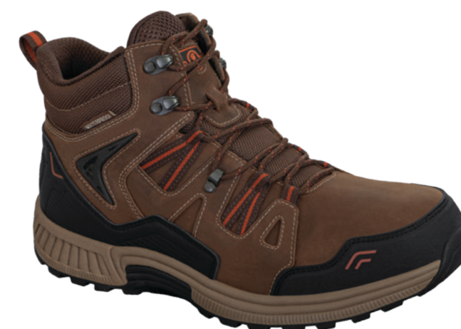
492 Ridgewood Brn