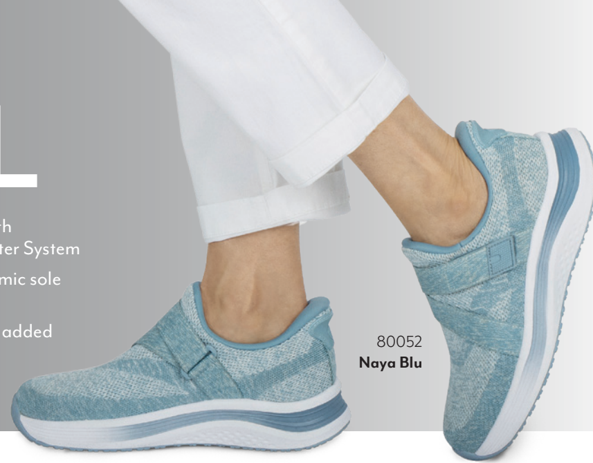
80052 Naya Blu