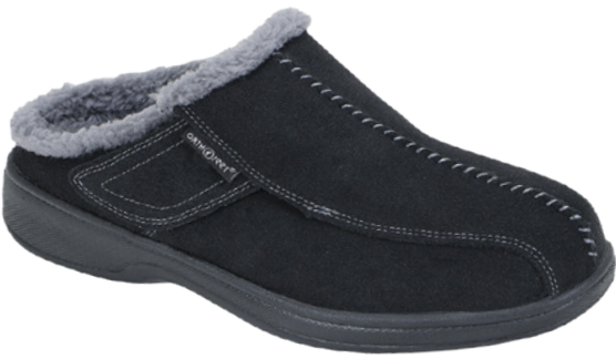
S333 Asheville Blk (Not Covered by Medicare) Widths: M, W, XW