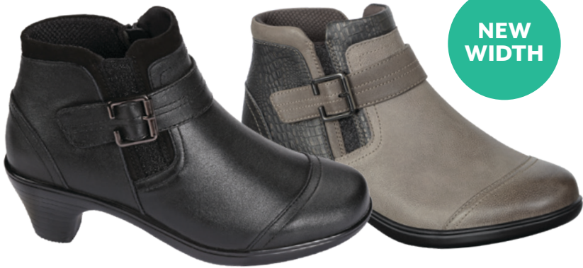
241 Emma Blk , 243 Emma Tau