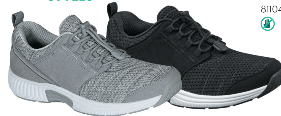
844 Francis Gr, 849 Francis Blk