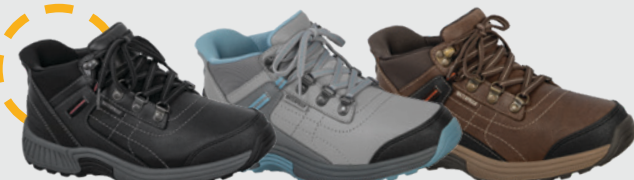
Women's Carmel, page 9