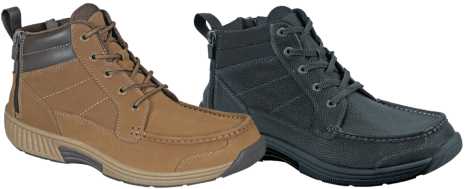
486 Ryder Brn , 483 Ryder Blk