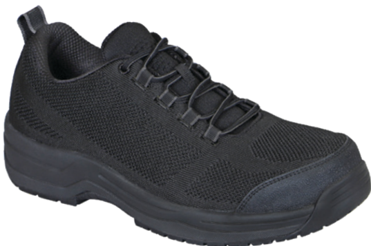
612 Cobalt Blk