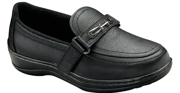
817 Chelsea Blk Two-Way Strap System