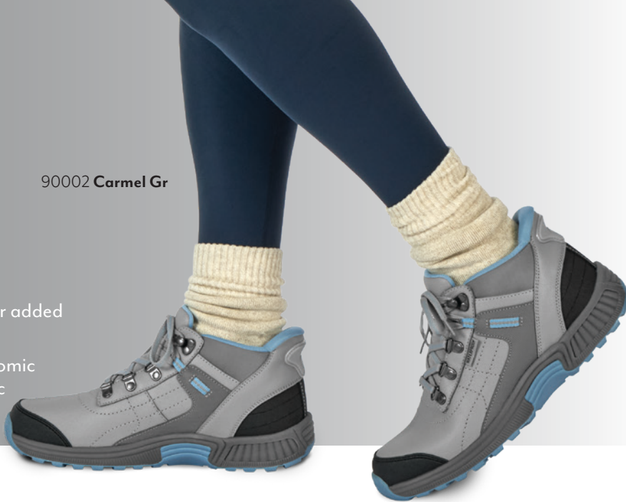
90002 Carmel Gr