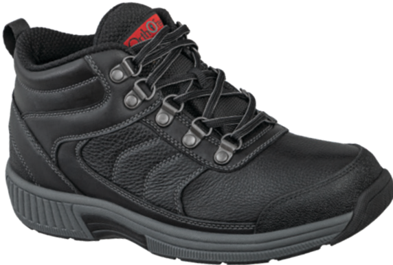
880 Delta Blk