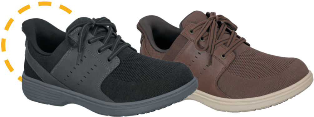
20216 Siron Blk, 20217 Siron Brn