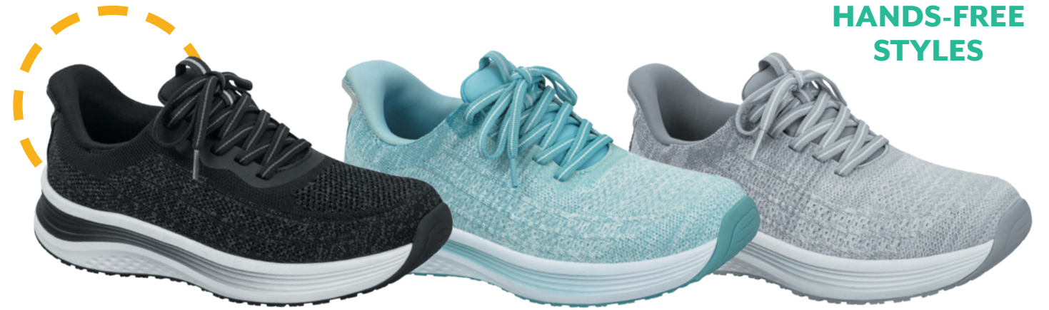
80023 Nira Blk, 80022 Nira Tur, 80021 Nira Gr