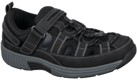
575 Clearwater Blk