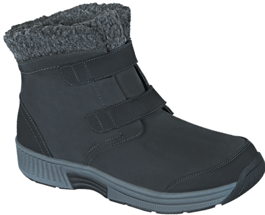
886 Florence Blk